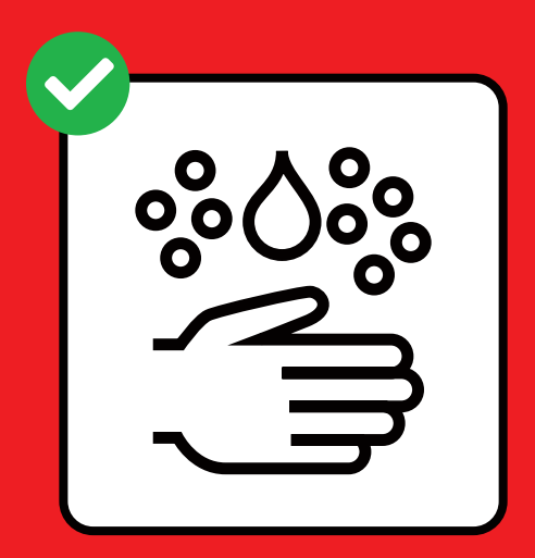
Wash your hands thoroughly.