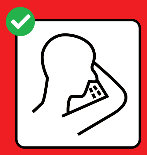
Cough and sneeze into a tissue or the crook of your arm.