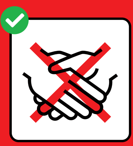
Avoid shaking hands.