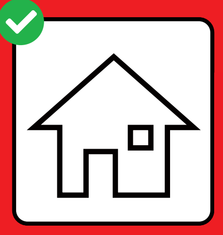
Stay at home if you have got a high temperature and a cough.